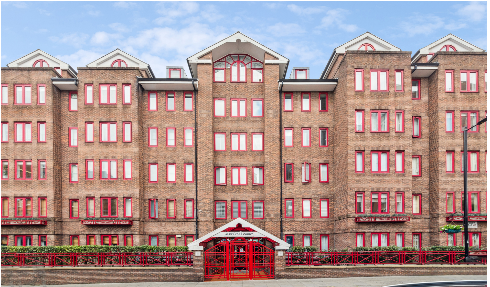
Alexandra Court Moscow Road W2